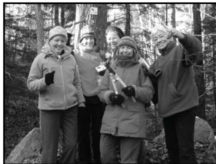
A group of dedicated local volunteers hang tin squares along the Sweet Trail.