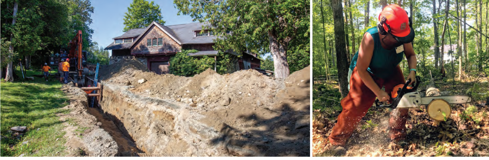
Facing page: In fall 2021, a ceremony was held to celebrate the new conservation easement on the Morrill Farm in Boscawen. Left: In summer 2021, the first phase of construction began on the 1884 Carriage Barn at The Rocks with the trenching of new utilities. Right: In partnership with the University of New Hampshire, the Forest Society hosted Women in the Woods, a program for women landowners and managers that teaches forestry skills.

conservation restrictions on lands owned by others, we conducted 377 ground monitoring visits and met with 185 landowners, in addition to monitoring our easements virtually using our industryleading satellite imagery.