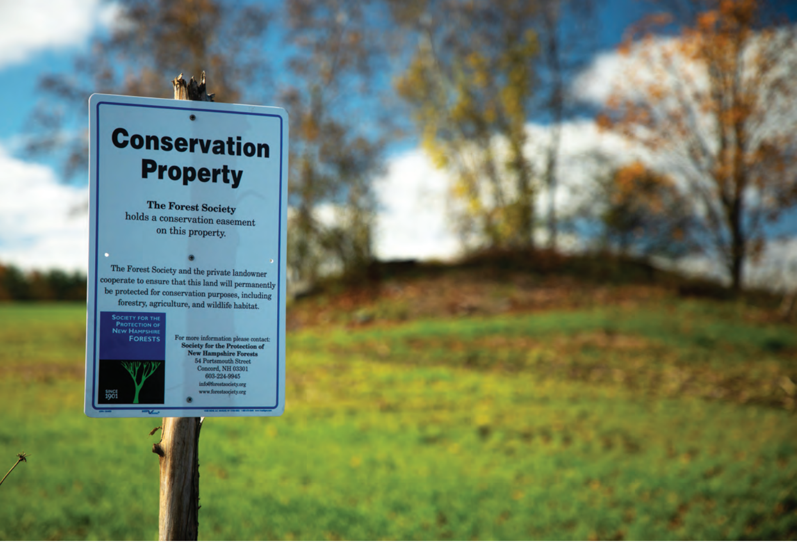
In 2021, the Forest Society worked with the Morrill Family to purchase a conservation easement on more than 120 acres of high-quality farmland in the Town of Boscawen.