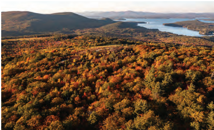
Top left: Reiner Woodland, 849 acres in Andover and Salisbury. Top right: Derevyia Farm, 116-acre conservation easement in Allentown. Bottom: Addition to the Morse Preserve, 222 acres in Alton.