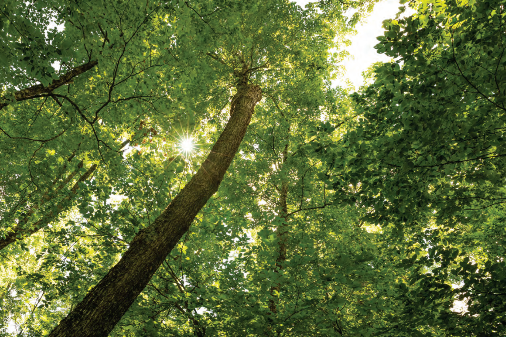
The sun pokes through the canopy at the Yatsevitch Forest in Cornish.