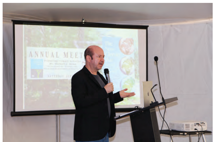
Inspired by climate scientist and activist Dr. Michael Mann, who was the keynote speaker at the Forest Society's 2022 Annual Meeting, we undertook several carbon assessments in FY23.

With UNH, we are performing silvicultural research at the Wilkins-Campbell Forest in Deering to investigate how oak-pine forest types respond to management practices intended to improve forest resources, increase their adaptive capacity to withstand climate change, and sequester carbon.