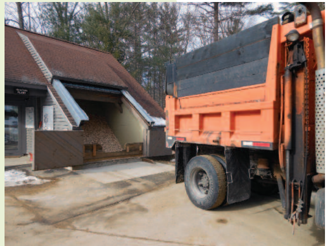
A truck gets ready to dump wood chips into the hopper at the wood-burning heating plant at the Conservation Center, the Forest Society's Concord headquarters.